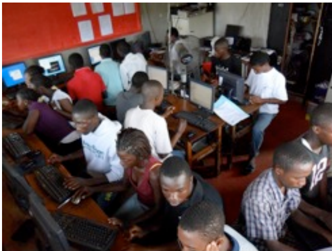
ICT room – Lumley, Freetown.

http://www.communityalbums.com/music/tb-can-be-cured