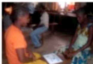
Girls learning to explain the Gender Equality Laws to each other. [Above]